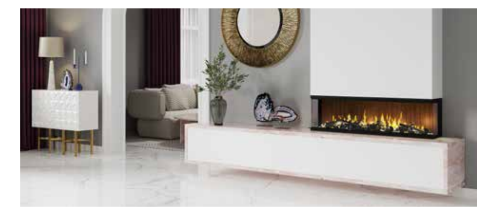
3 installation options 3 sizes, 1-, 2- or 3-sided decorative fireplace