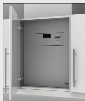
Kitchen Cupboard Installation

The Xpelair Natural Air 180 has been designed for easy installation. It includes a reversible core to enable left or right hand mounting. It also comes in two lightweight sections - a 9.5kg metal case and 10kg EPP structural foam body (total 19.5kg).