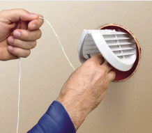
Fold the outer grille.

ANCILLARIES We recommend the Inside Fit External Wall Kit to allow fuss-free fitting from the inside.