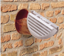
Push through the wall tube.