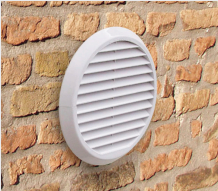
Pull back on the string to secure to the outside wall.