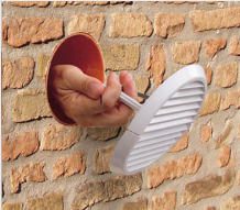
Open up the outer grille.