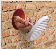
Open up the outer grille.