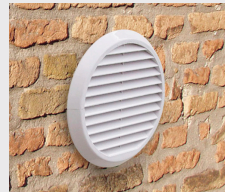
Pull back on the string to secure to the outside wall.