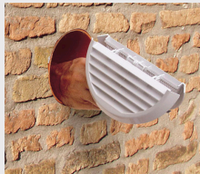
Push through the wall tube.