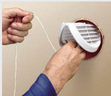
Fold the outer grille.

We recommend the 150mm Inside Fit External Wall Kit to allow fuss-free fitting from the inside.